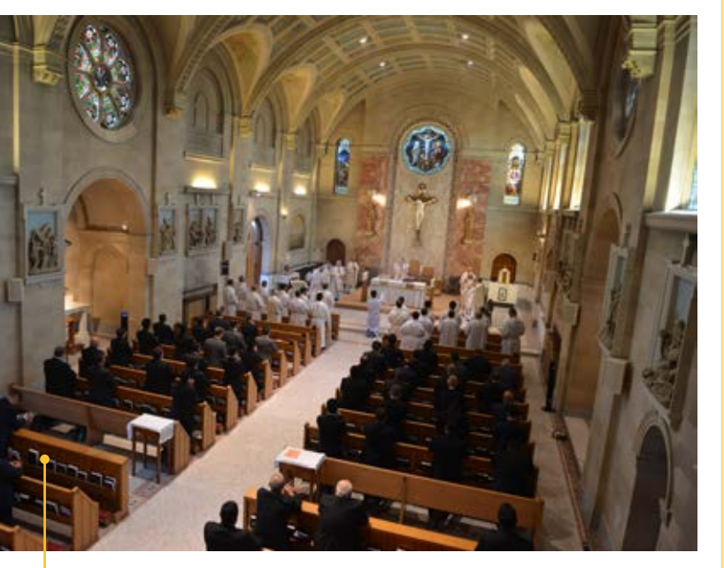
St. Augustine's honoured its alumni with a special reception and Mass at the Seminary on September 19, 2018. It was a beautiful celebration, where priests who have been ordained for over 40 years received a memorial icon of St. Augustine.