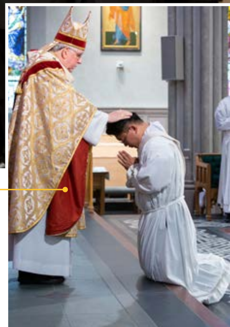
Ordinations for the Archdiocese of Toronto at St. Michael's Cathedral Basilica June 27, 2020