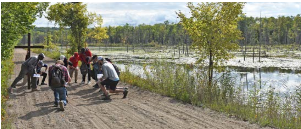
Spiritual Year seminarians pray during their Martyrs' Shrine pilgrimage walk last fall.