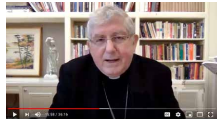
Cardinal Collins on Preaching